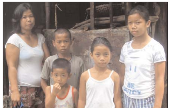
• Mother and children in front of the pig pen, where they raise two piglets given by the Project.

Find out more by visiting www.bambangsunshineproject.org.uk