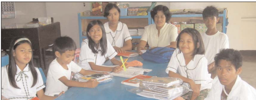
• SPED teacher with 7 of the 8 children with speech and hearing impairments who the project help.